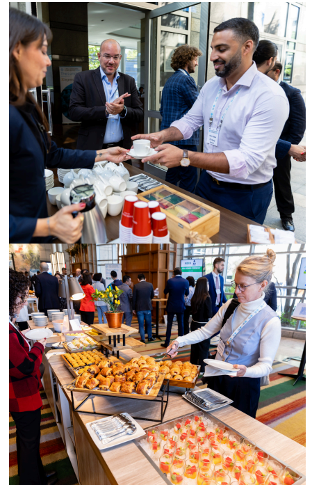
Lunch 2 & 3 July 2024