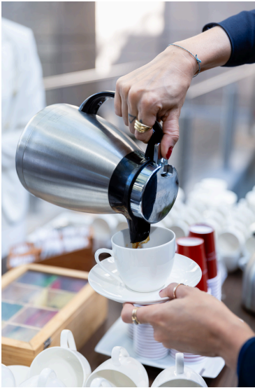
Coffee Breaks 2 & 3 July 2024

The Cofee Breaks, offered by REDEX, and the Lunches, offered by 3Degrees were hosted in the Grand Hyatt.